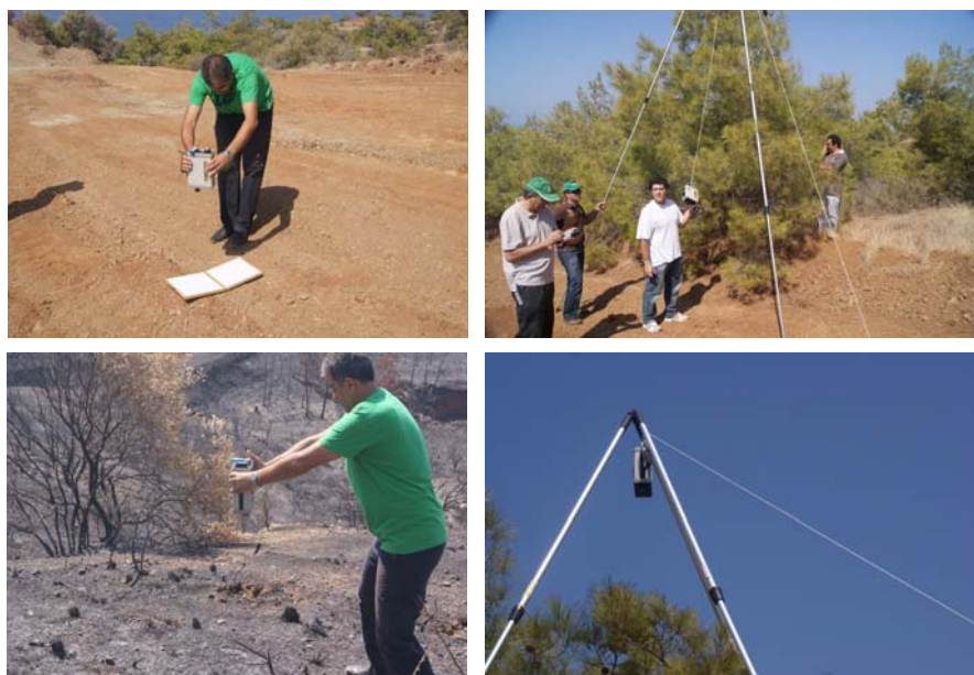
Figure 3: Use of GER1500 field spectro-radiometer.

Using the ground spectroradiometer Spectra Vista GER 1500 mounted on a tripod, the spectral signatures of several trees canopy were recorded as well as records from an adjoining burnt area. GER1500 can record electromagnetic radiation from 350nm until 1050nm covering both visible and near infrared spectrum. The instrument was lifted up to a height of approximately 6-7 m above ground while the field of view (FOV) was set up to 4°. Emphasis was given to spectral signatures of trees which were planted (artificial regeneration) as a post fire management action.