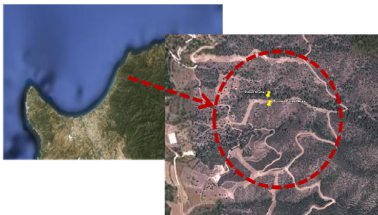
Figure 2: Study area.

Using the ground spectroradiometer Spectra Vista GER 1500 mounted on a tripod, the spectral signatures of several trees canopy were recorded as well as records from an adjoining burnt area. GER1500 can record electromagnetic radiation from 350nm until 1050nm covering both visible and near infrared spectrum. The instrument was lifted up to a height of approximately 6-7 m above ground while the field of view (FOV) was set up to 4°. Emphasis was given to spectral signatures of trees which were planted (artificial regeneration) as a post fire management action.