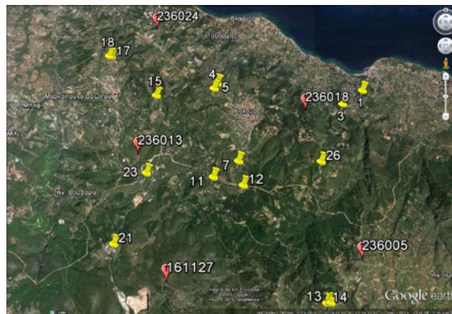
Figure 2: The area under study in Northern Attica – Greece and the locations of the GGRS87 benchmarks (red pins) and the GCPs and CPs (yellow pins).

The study of the effect of the transformation between global and national reference system in the final coordinates of GCPs and CPs is performed in an area 10 km × 10 km approximately. The area under study is located in the northern part of Attica region in Central Greece. In Figure 2 the locations of the GCPs, the CPs and the benchmarks of the national trigonometric network used in our computations are depicted.